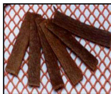
Polypropylene Screen (220°F Service Temp)

USDA-Approved Teflon Coated Fiberglass: Smokehouse non-stick screens that offer superior release, flexibility, dimensional stability and thermal resistance. Sealed edges included.