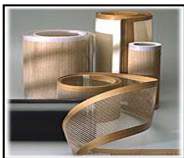
PTFE Coated Fiberglass (500°F Service Temp)

Hi-Performance Products offers a wide variety of specialty screening materials that were specially formulated for use in the Jerky Processing Industry, to eliminate jerky products from sticking to stainless steel racks.